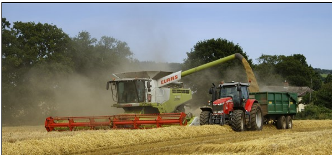
The Harvest, behind Cliff Road (with thanks to Stan Baston)