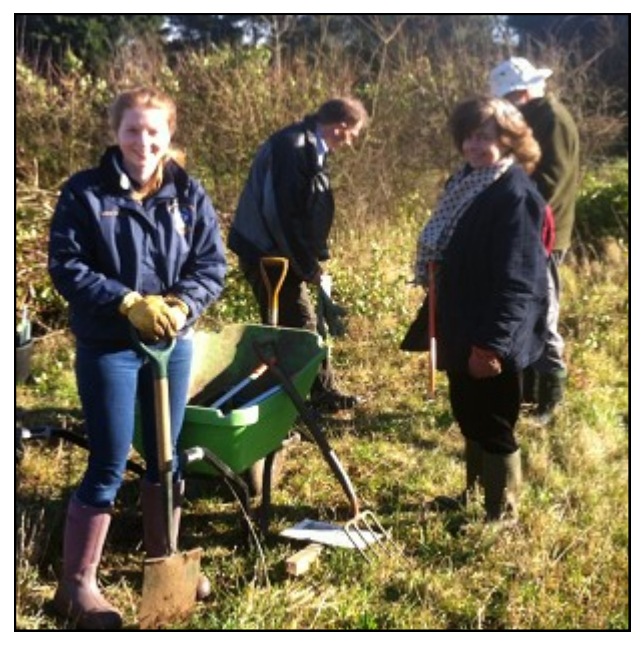
AONB volunteers work alongside village residents to help clear vegetation from Church Field hedgerows - Feb 2016