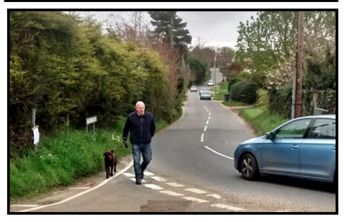
Happily, the on-coming cars were not 10 seconds earlier!