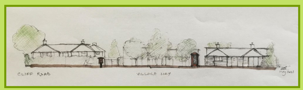
Artistic impression of new street scene

We are delighted to announce that Suffolk Coast and Heaths Area of Outstanding Natural Beauty have awarded a Sustainability Grant to move, refurbish and fit out the redundant Mill Road phone box. It will be moving to a new home in Village Way, on the verge adjacent to Cliff Road and No19, where it will balance the street scene complimenting the post box on the opposite side.