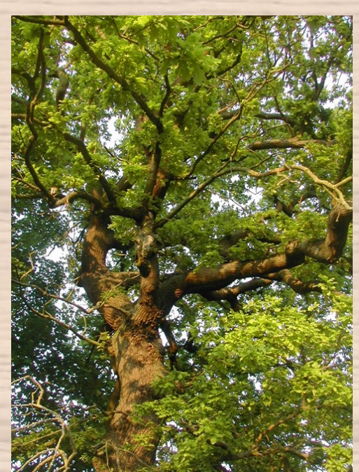
Oak Tree in our garden

The Queen's Green Canopy (QGC) is a unique tree planting initiative created to mark Her Majesty's Platinum Jubilee in 2022 which invites people from across the United Kingdom to "Plant a Tree for the Jubilee." (quote from the website). From October new plantings can be dedicated to the Canopy and plotted on the website map. There is