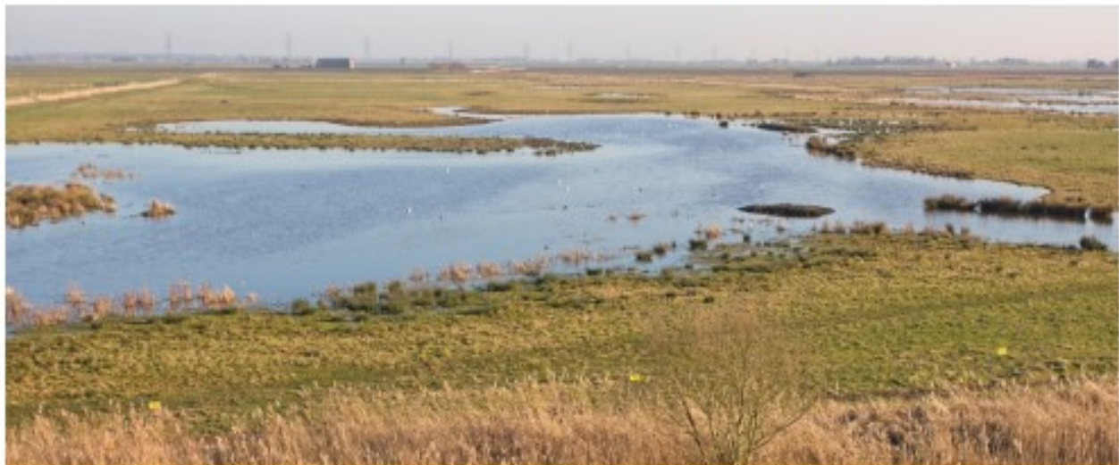
Rewilded Lady Fen, Welney Wetland Centre, Welney, Norfolk, England, UK.

on Saturday 12th October at 11.00 am at Waldringfield Village Hall