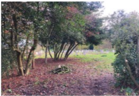
Clearing brambles and overgrown scrub late last year.

However, slowly but surely, things are getting back under control thanks to the stirring efforts of a few volunteers. The grass paths are being mown regularly again. The holm oak has flourished since being released from its smothering cage of brambles, and the weeds around the church walls are being kept down, which should help minimise the accumulation of damp in the brick work. Over the next few weeks the longer grass, and wilder areas, will receive their annual 'haircut'.