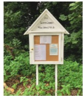
The newly restored notice board.