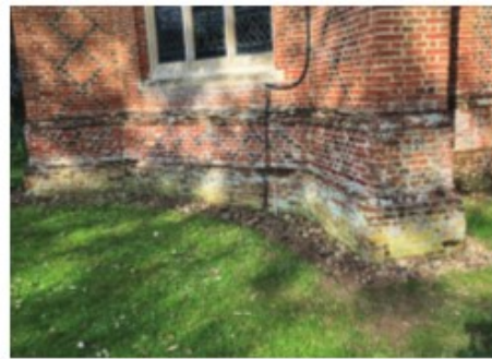
Digging out persistent weeds around the base of the church.