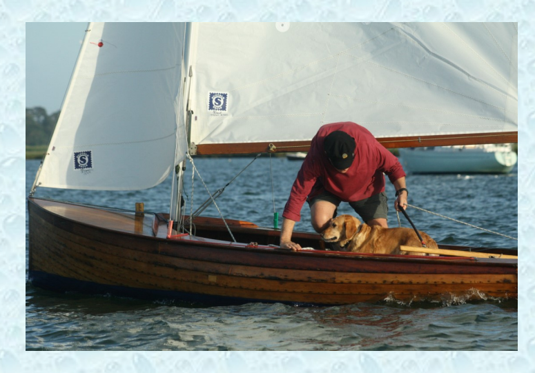
'One man and his dog' at the 2019 Regatta

Looking further ahead, the club's Regatta starts on 17th July, with races and shore games for children – good spectator sports! The Regatta ends with the much-loved Yachtsmen's Service at 6pm on 19th July, to which all are welcome.