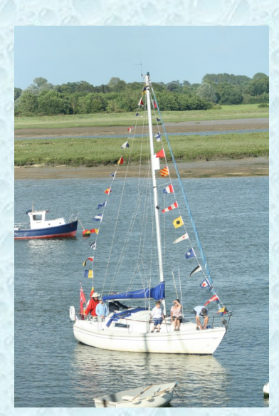
Yacht arriving for the Yachtsmen's Service