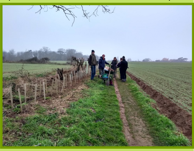
Work party planting 43m length of hedging along the footpath between the Church and the Sailing Club, 22nd January 2020. 10 volunteers from the village and from Ipswich came out to help.

On Friday 10<sup>th</sup> January 2020, 12 enthusiastic planters gathered on Mill Road to plant 110 metres of mixed native hedging. In just an hour and a half all 560 trees were planted. Many thanks to our volunteer planters from inside and outside of the village. The hedging was funded by Suffolk Coasts and Heaths and Waldringfield, Newbourne and Hemley Scattered Orchard Project. Thanks also to Andy Archer of Newbourne for digging the site over prior to planting – this made the job so much easier.