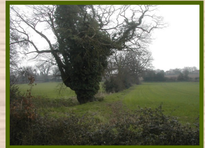
An ancient oak in our village

As well as planting new trees it would be good to look after some of our old veteran trees which are such a feature of the village. On old maps the large trees are shown individually at intervals around the farm hedges which are now enclosed in the village. Some of these are still in place. We need to look after them and put back more to replace the ones which have gone for future generations to enjoy and benefit from.