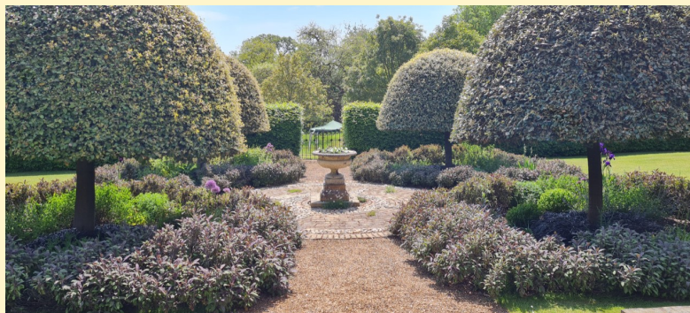
Photo from our visit to Rivers Hall last year

There are some other areas, that don't conflict with the Village Verges, that we have our eyes on - and doing them together will be so much more fun.