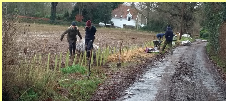
Planting the hedge along Sandy Lane

There are some spare native hedging plants such as hawthorn, field maple and crab apple. Please get in touch if you wish to plant hedges or trees in the countryside.