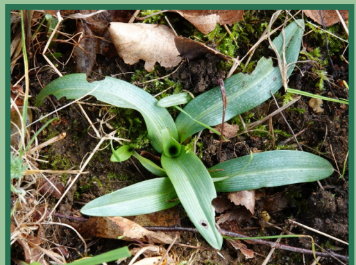
Newly emerged Bee Orchid leaves.