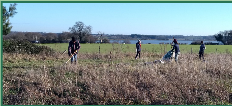
Work party members scything.

Cutting out of overgrown Japanese honeysuckle near the car park, some scrub clearance, the reinstatement of a path, tree pruning and grass scything were undertaken. The next work party will be held on Wednesday 6 th March and on the day your help with jobs such as bramble bashing and grass raking will be much appreciated.