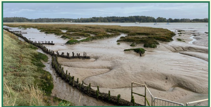
View from photopost

Helene has recently offered further opportunities to record and monitor what is happening here at Waldringfield, this time looking the other way towards Felixstowe. Another PhotoPost is in discussion to be placed adjacent to the sea wall South of the Sailing Club. It would capture the view towards the saltmarsh and beyond Early Creek, a fantastic opportunity to monitor the edge of the marsh and the effects of flood deposits on the beach. Very often including shingle, weed, vegetation and mud. Mud is something we discuss a lot around here if you have any relationship with the river!