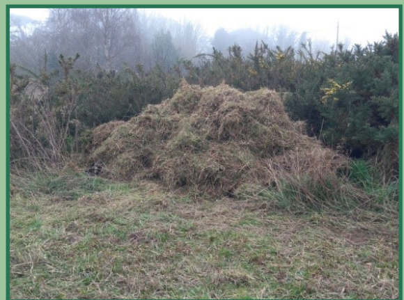
The cut grass made several haystacks.

Please get out and enjoy the field when you can. The spring flowers will be starting to appear soon.