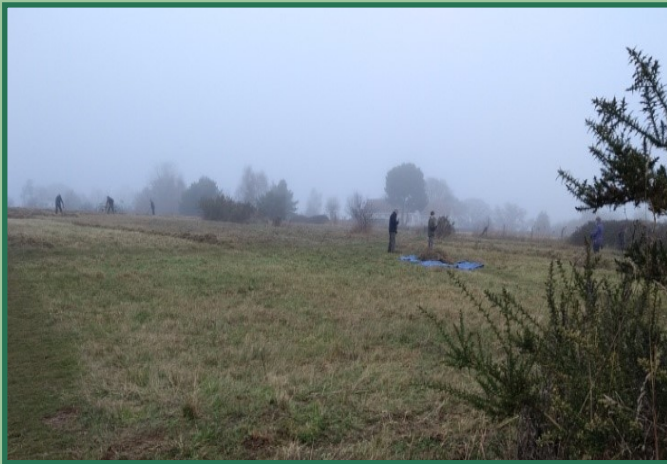
Work party members

We had our 21 st AGM on December 4 th when reports were given out, illustrated with lots of photographs of the field through the year and also in the past years. It would be lovely if more members of the community could attend but it was a very cold and frosty night! We were however warmed by mulled wine and hot mince pies. Remember that Church Field would be a great place to view the stars and planets on clear nights, which were particularly good this January, and the skies are spectacular if you can get away from the light pollution surrounding us closer to dwellings .