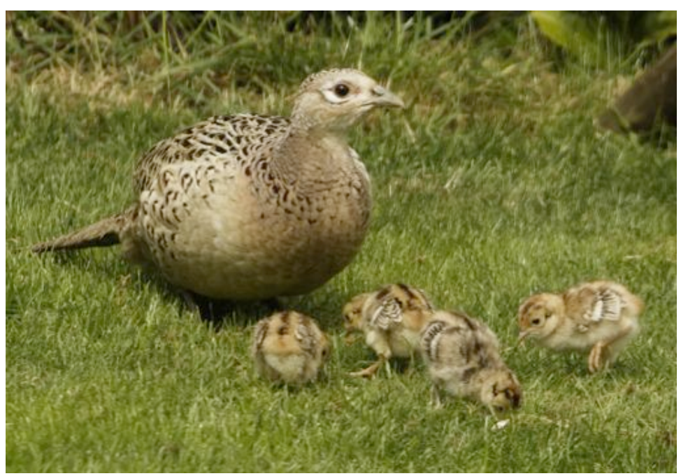
Hen Pheasant and four chicks that visited Stan Baston's garden on several occasions.

The start of the breeding season was late, but eventually a few spells of sunny, settled weather gave some hope of success to nesting birds and recently several people have reported quite large numbers of young birds of various species in their gardens. This was particularly evident where people continued to stock their garden feeders. Sally wrote on the 20<sup>th</sup> June, 'There are so many bird families on my feeders just now - ie blue tits, great tits, a few coal tits, greenfinches, goldfinches, starlings - all vying for space, plus blackbirds on the grass and daily visits from the great spotted woodpecker adult and young. The young are still being fed by adults though feeding on their own too. I have never known such a high number.'