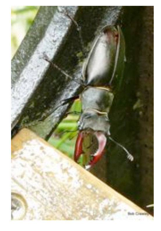
Stag Beetle male

Fearsome looking but the antlers, not jaws, are use to interlock and fight other males in courtship battles.