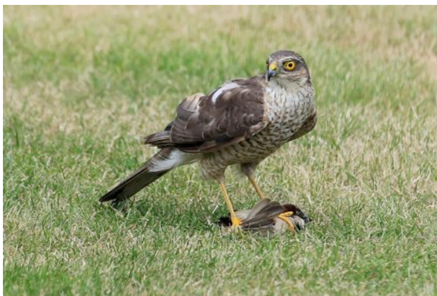
Sparrowhawk with House Sparrow prey on Stan Baston's lawn.

Kestrels must have nested in the area with them being seen throughout the summer along Mill Road, over the fields in Waldringfield Heath and over the fields below Sandy Lane. A dead Kestrel was found on the Ipswich road along the golf course bends on the 15 th Oct. Whilst people have not been feeding small birds in their gardens